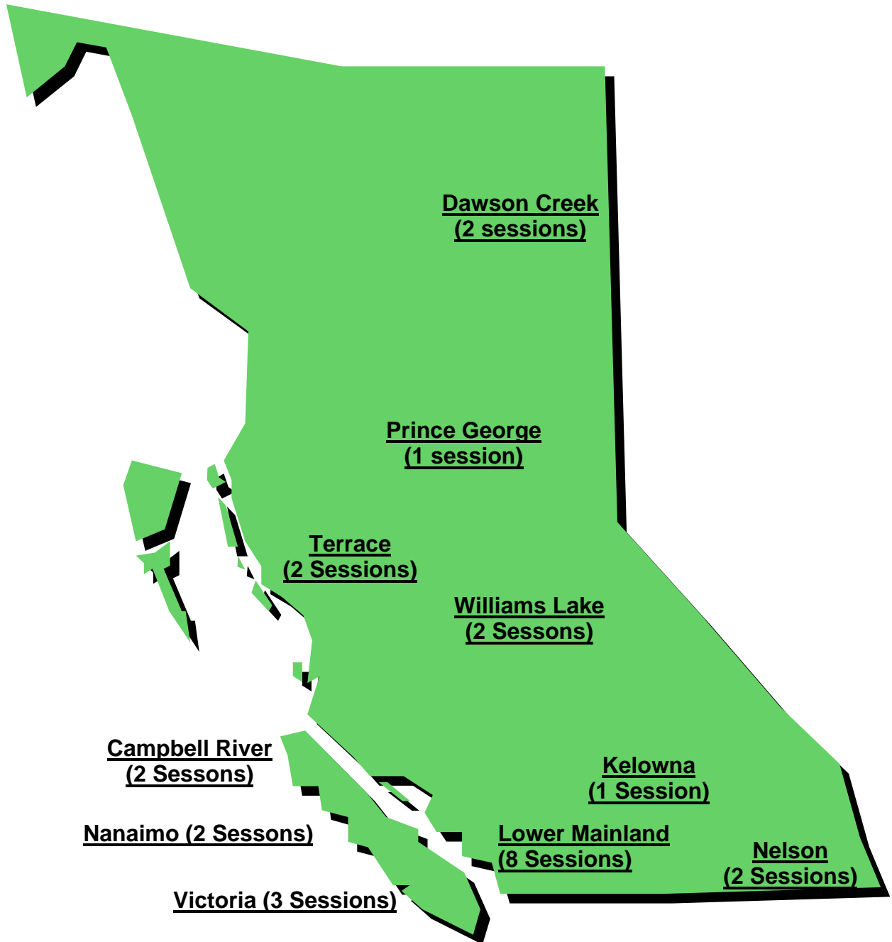
Figure 1: Location of Phase 2 Focus Groups